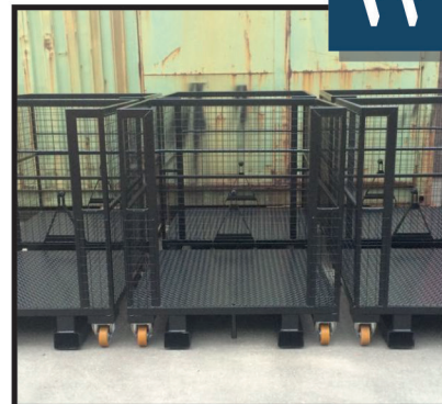
Bespoke warehouse solutions