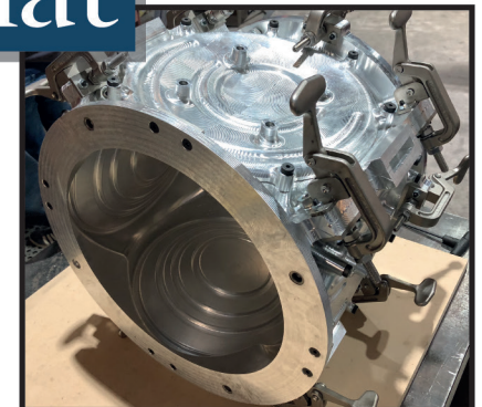
Rotational moulding tooling